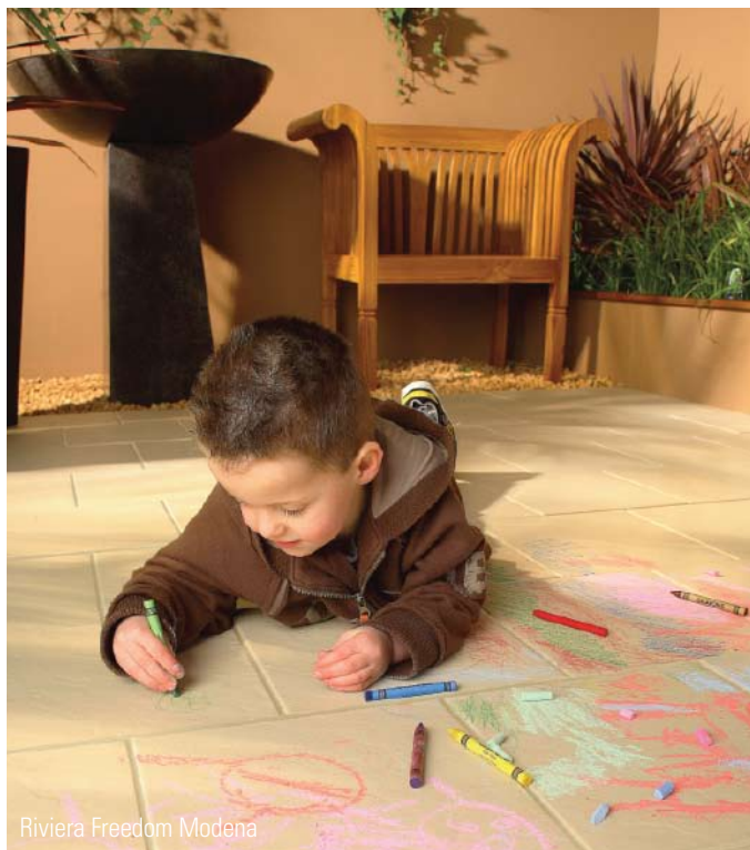
Riviera Freedom Modena