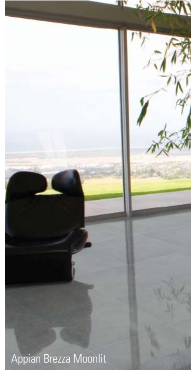
Appian Brezza Moonlit

Eureka Tiles Australia is a member of the Brickworks group of companies and is Australia's largest manufacturer of glazed and unglazed ceramic floor tiles. Information on the products offered by Eureka Tiles Australia can be obtained from Austral or Eureka Tiles direct.