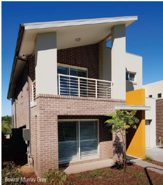
Bowral Murray Grey