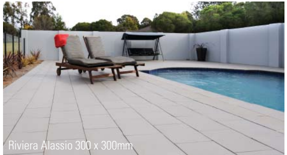
Riviera Alassio 300 x 300mm