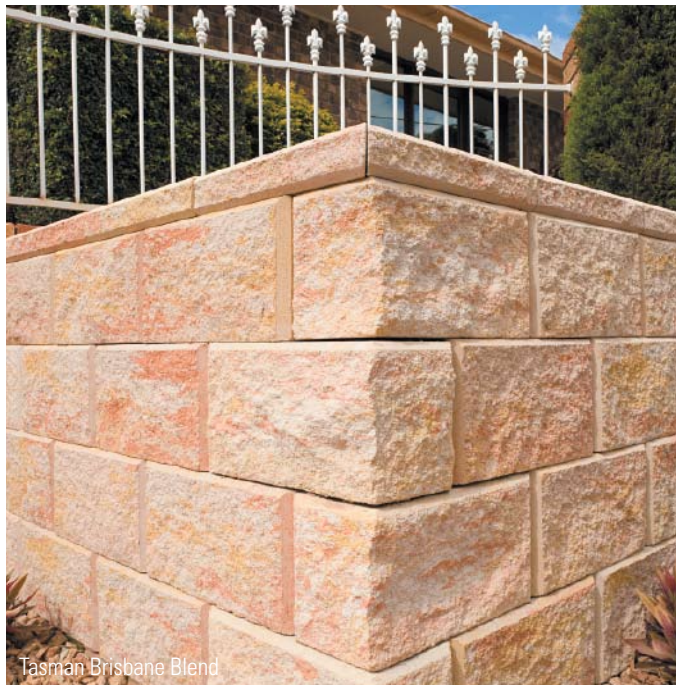
Tasman Brisbane Blend