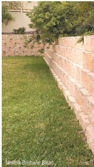
Norfolk Brisbane Blend

Retaining walls can be constructed using specific retaining wall blocks such as GB Retaining Wall Blocks or standard bricks. It is important to realise that the rear face of your retaining wall is just as important as the front face.