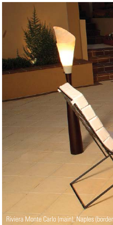
Riviera Monte Carlo (main), Naples (border)