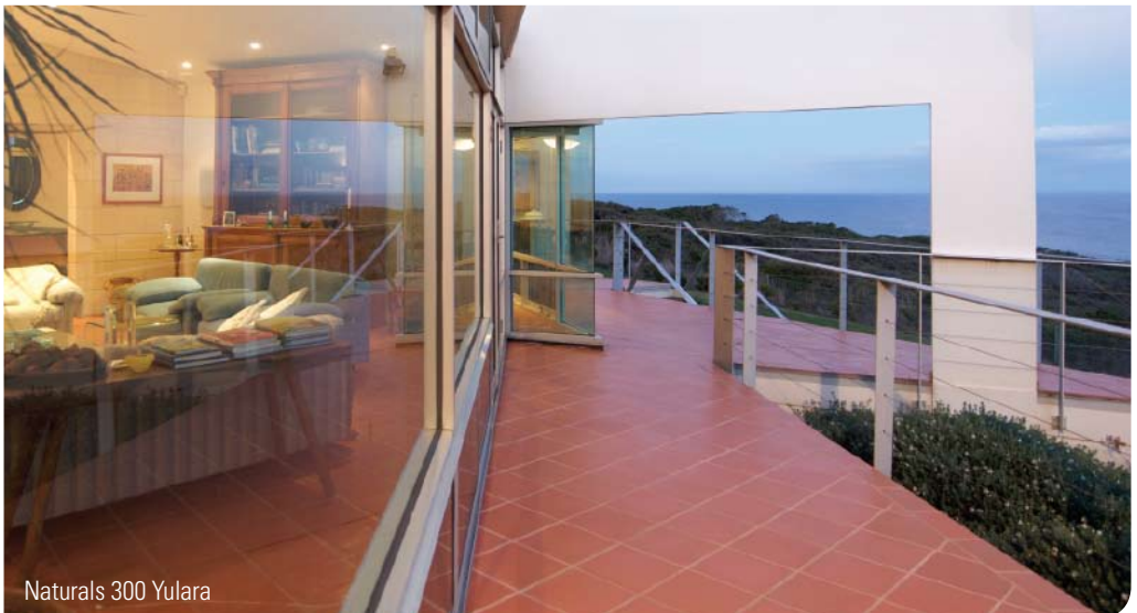
Naturals 300 Yulara

There are numerous other staining agents such as blood, ink, egg, coffee and numerous other beverages and foodstuffs, which could come in contact with tiling and require spot cleaning. Abrasive cleaners such as Gumption, etc. should be tried using a plastic scourer. Make sure that you rinse off well afterwards.