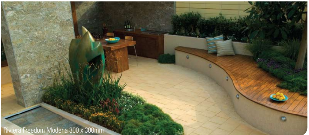
Riviera Freedom Modena 300 x 300mm