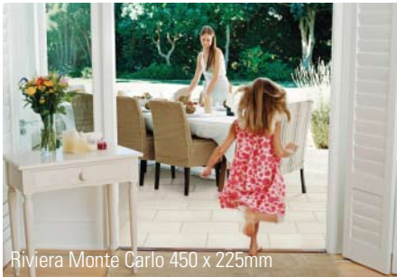
Riviera Monte Carlo 450 x 225mm

Warning: Some of the poisons in fungicides may discolour the pavers. Check their effect on a small part before proceeding to clean the whole area. Pay attention to nearby garden plants or lawn, especially on the lower side of the paver area being treated.